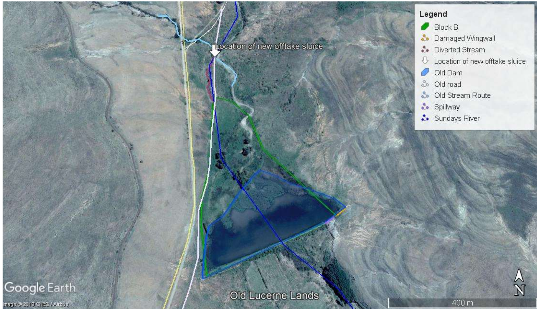
Figure 3: Block B prior to the development