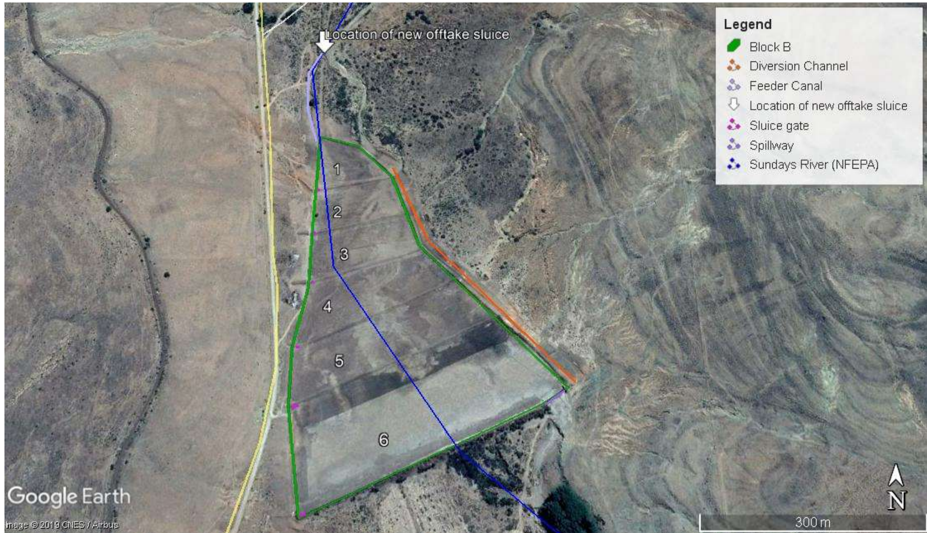
Figure 4: Block B after the development