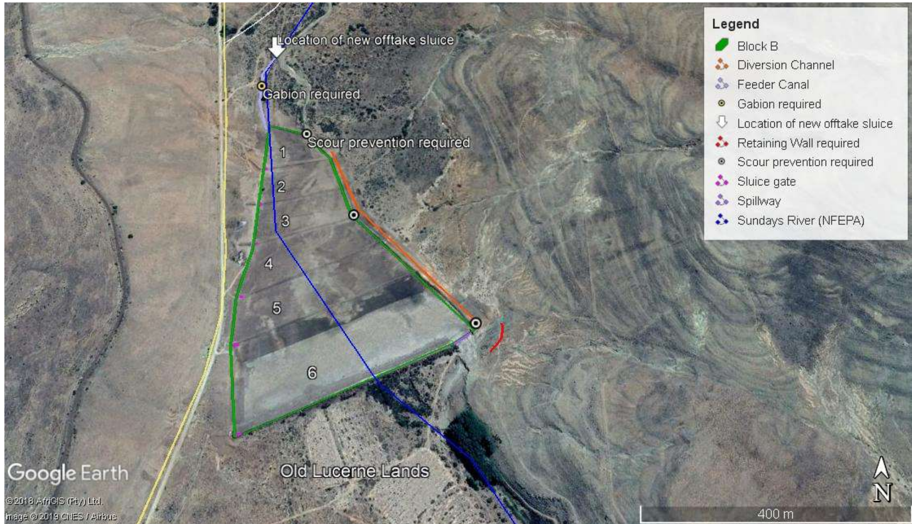
Figure 5: Work required in Block B