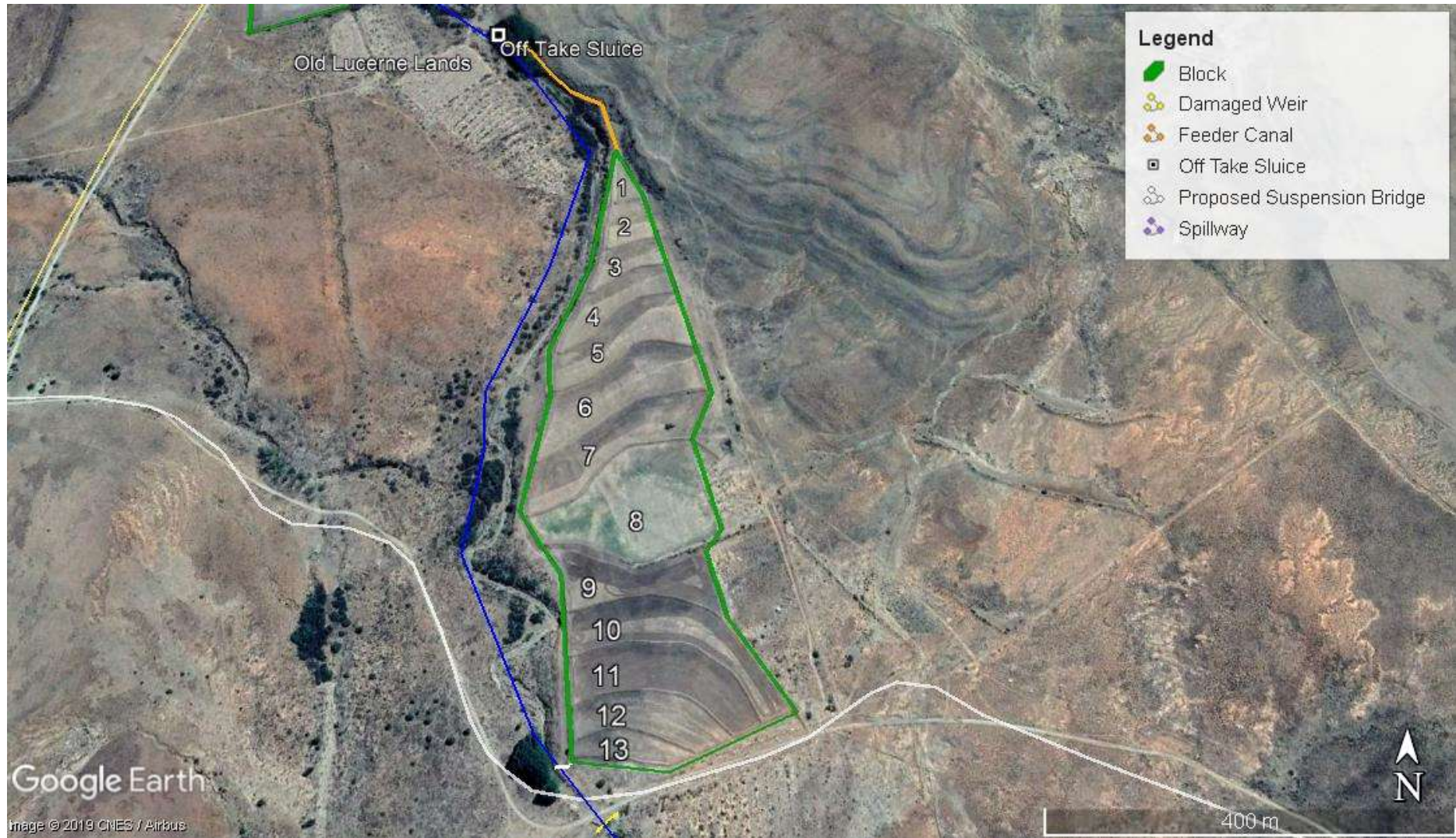
Figure 2: Block A after the development of the irrigation basins