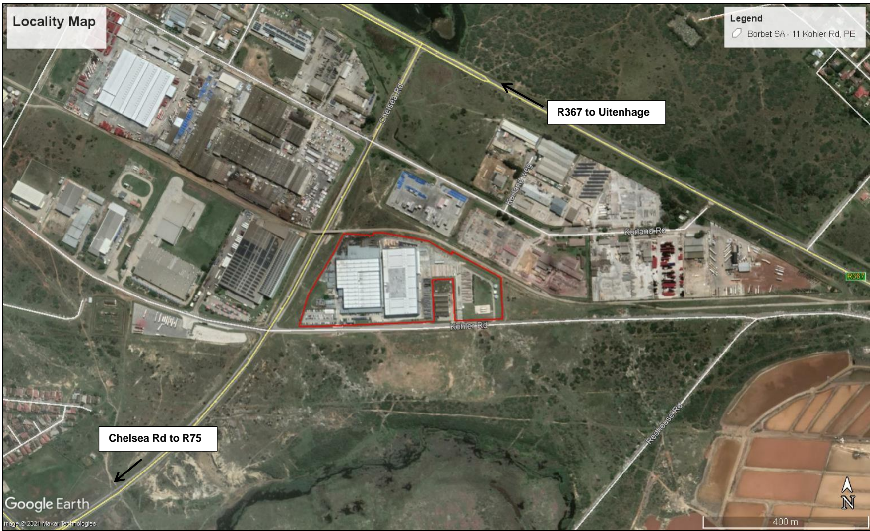
Figure 1: Locality Map