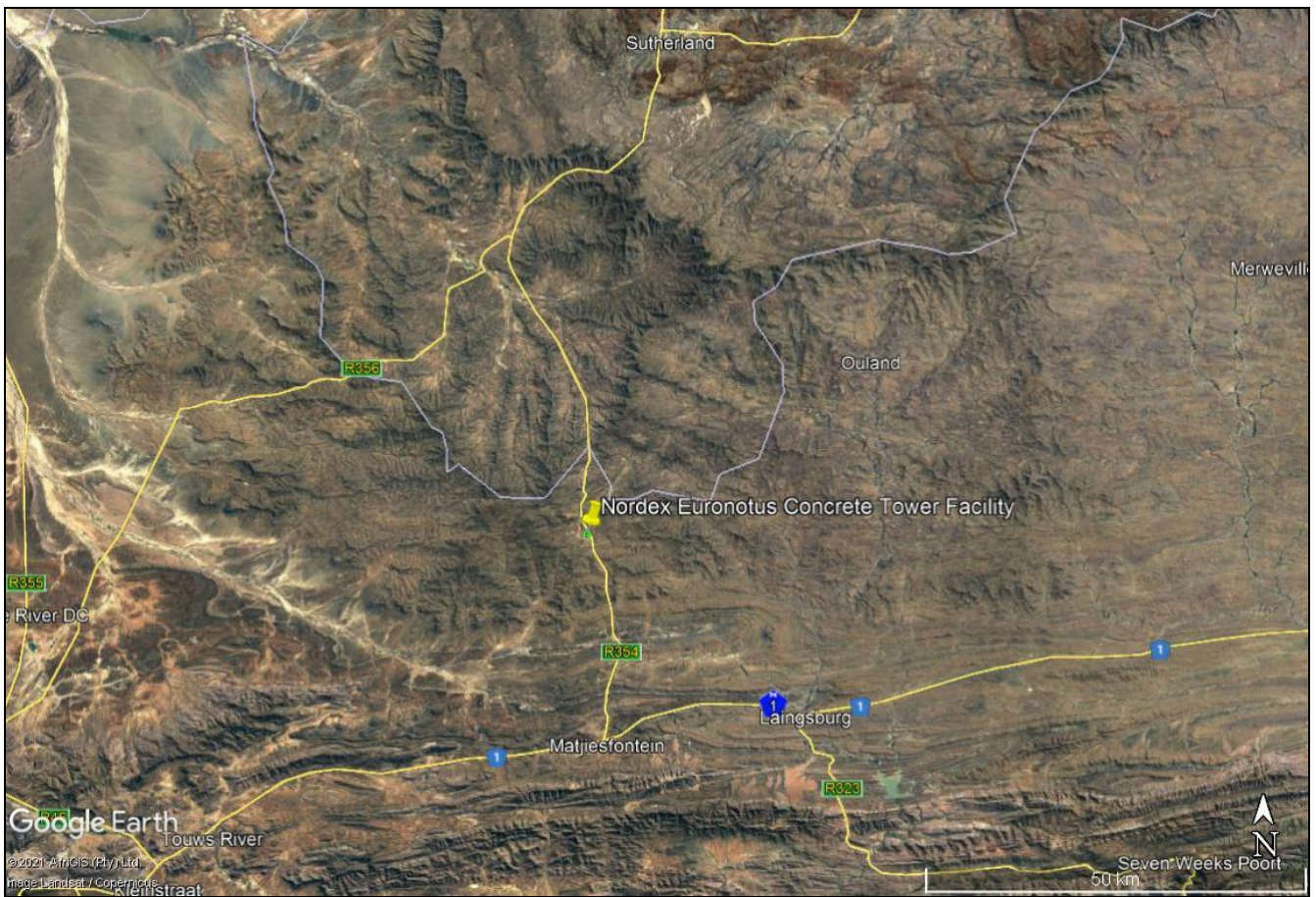
Figure 1: Locality Map