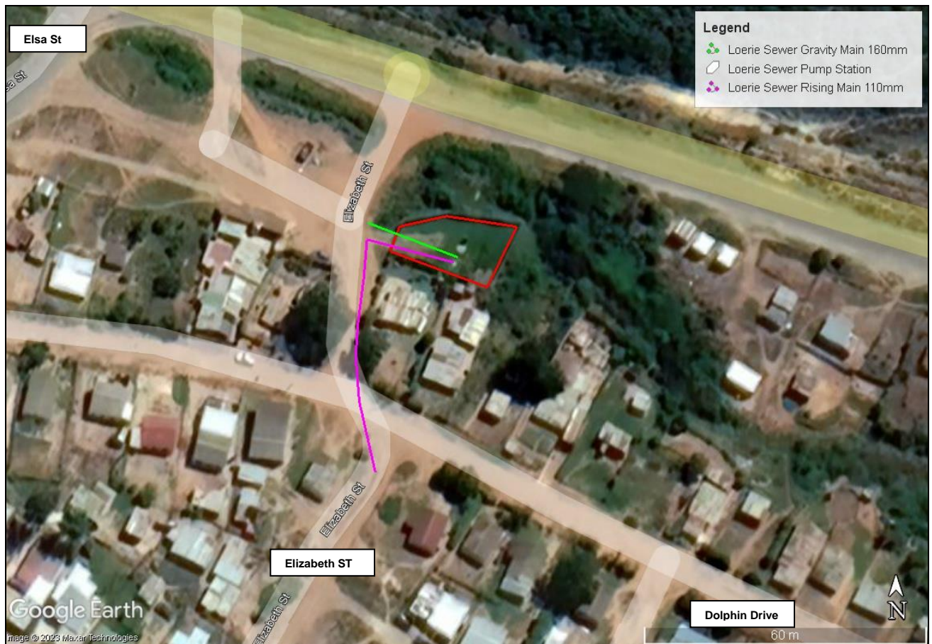
Figure 2: Site Locality