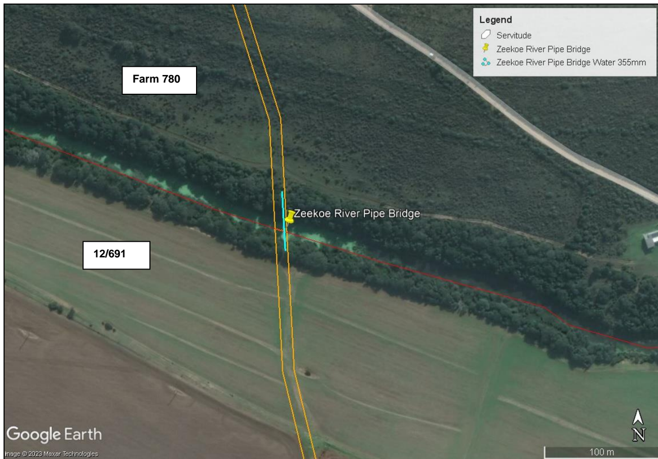
Figure 2: Site Plan